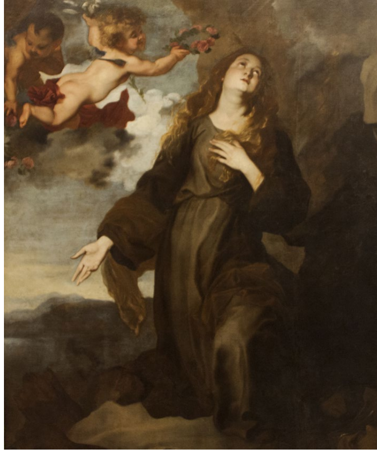
4. Antoon van Dyck, St Rosalia Crowned by the Angels, Palermo, Palazzo Abatellis