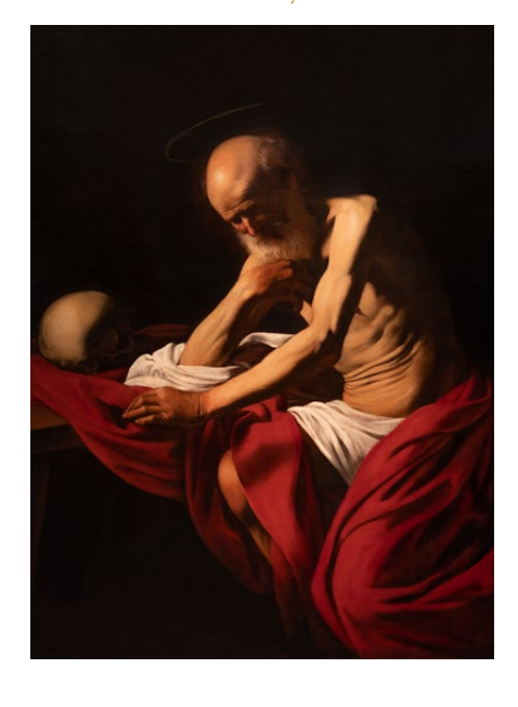
2. Caravaggio, St Jerome, Monserrat, Museum of the Monastery of Santa Maria

The first is a wax depicting the Penitent St Jerome signed and dated Mattheo Durante fecit 1663 ( fig. I ), belonging to the collection of the aristocratic Nava family of Siracusa. Details such as the crucifix, the skull and the vegetation are almost identical in both small works. The St Jerome recalls the painting of the same saint by Caravaggio ( fig. 2 ), formerly in the Giustiniani collection and now in Spain, in the Monastery of Santa Maria in Monserrat ( Mondi in miniatura , p. 18, Fig. 6). Durante's