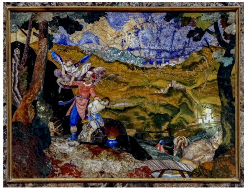
6-7. Florentine Grand Ducal Workshops, A Landscape with Grape Harvesters and The Sacrifice of Isaac , 1610-20. Florence, San Lorenzo, High Altar, Antependium.

At the Galleria Borghese in Rome there is a group of hardstone plaques that may have entered the collection by 1633. 10 Such works held a clear appeal for Cardinal Scipione Borghese, whose interest in commessi is documented from at least 1612. 11 Within this group of six, two landscapes