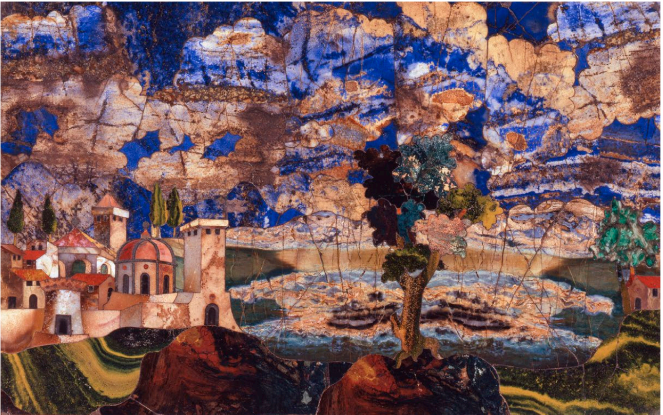
2. Florentine Grand Ducal Workshops, Landscape with a Fortified Town , detail, c. 1610

buildings, a church with a campanile and an adjacent octagonal structure—possibly a baptistery—topped by a ribbed dome are the most distinctive elements (figs. 1, 2).