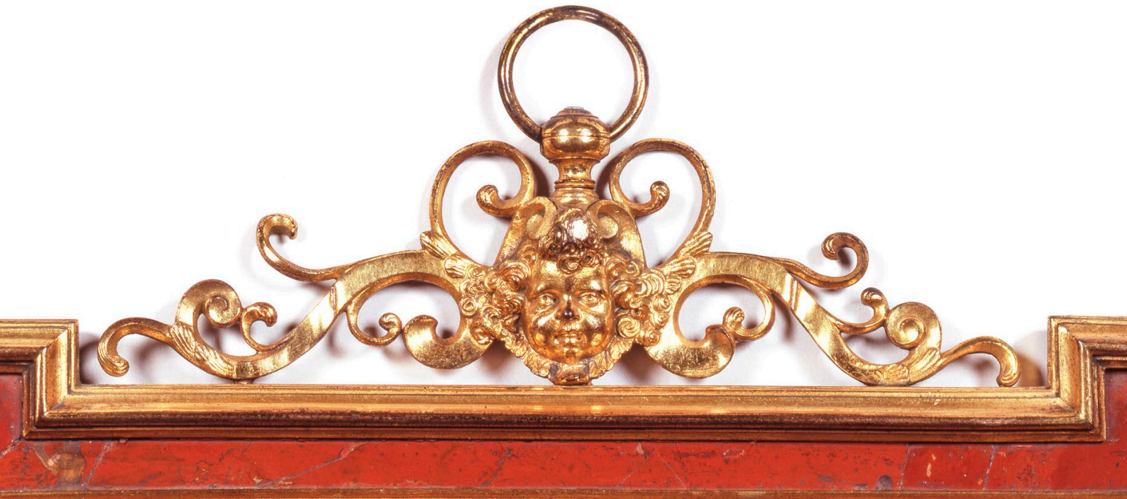
12-13. Florentine Grand Ducal Workshops, Landscape with a Fortified Town , detail of the frame, c. 1610