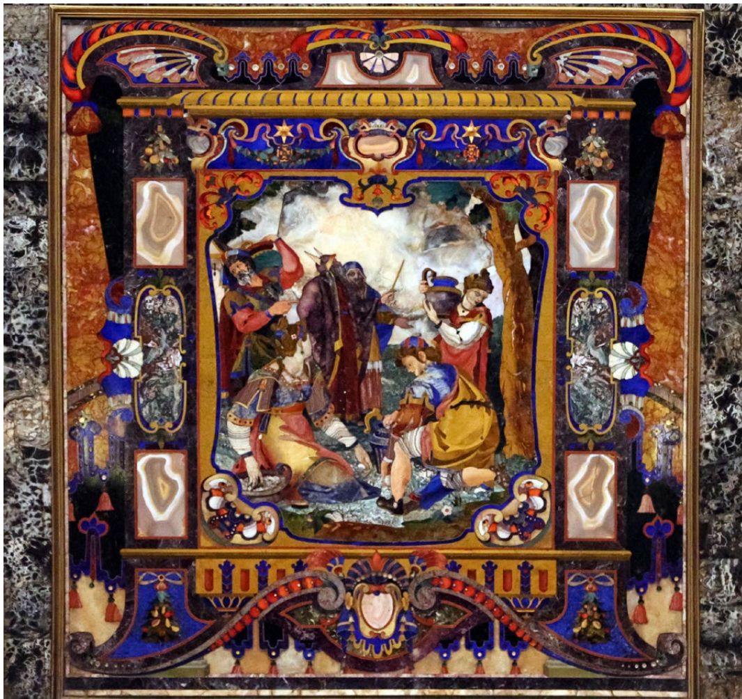
5. Giovanni Battista Sassi (after a design by Bernardino Poccetti, before 1612), The Fall of the Manna , 1620. Florence, San Lorenzo, High Altar, Antependium.

the central piece of the paliotto for the high altar of San Lorenzo in Florence, was flanked by two additional scenes: A Landscape with Grape Harvesters (fig. 6) and The Sacrifice of Isaac (fig. 7). 9 Although more heavily animated by figures, these rural views echo Poccetti's style and share affinities with the Tuscan Landscapes . Comparison between the present Landscape and the San Lorenzo mosaics—datable to the 1610s—is therefore highly relevant for placing the execution of the work discussed here in early seventeenth-century Florence.