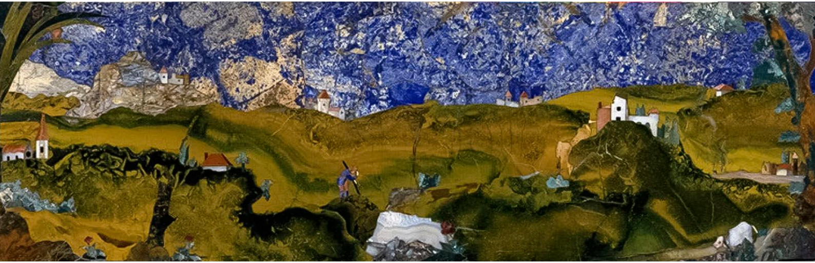
3-4 Francesco di Gaspero Salina or Camillo di Ottaviano Porfirio (after a design by Bernardino Poccetti), Tuscan Landscapes , 1608. Florence, Museo dell'Opificio delle Pietre Dure.