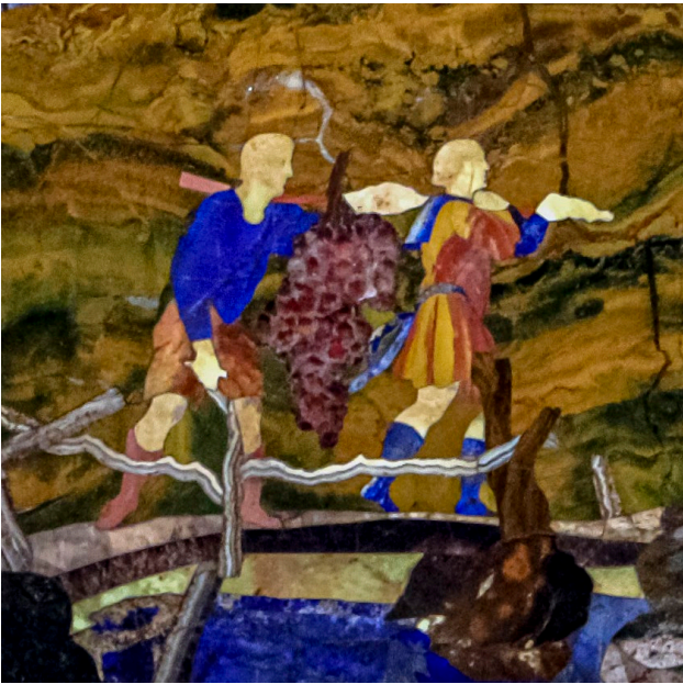
10. Florentine Grand Ducal Workshops, A Landscape with Grape Harvesters , detail, 1610–20. Florence, San Lorenzo, High Altar, Antependium.