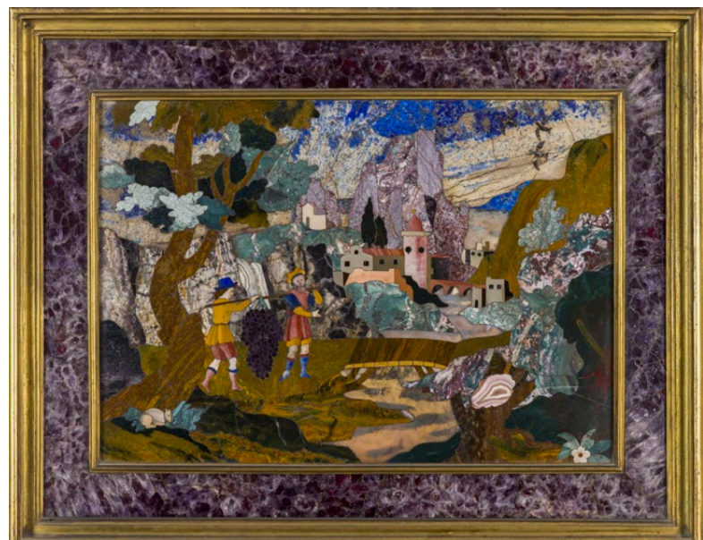
8-9. Florentine Grand Ducal Workshops (?), The Promised Land and The Sacrifice of Isaac , 1610-20. Rome, Galleria Borghese.