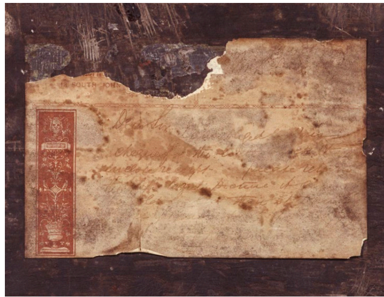
16. Florentine Grand Ducal Workshops, Landscape with a Fortified Town , detail of the back, c. 1610

la Madonna di Loreto in Santa Maria in Aracoeli, where the painter Marzio Ganassini worked around 1613, assisted by an anonymous decorator responsible for the ornamental elements (fig. 15). 23