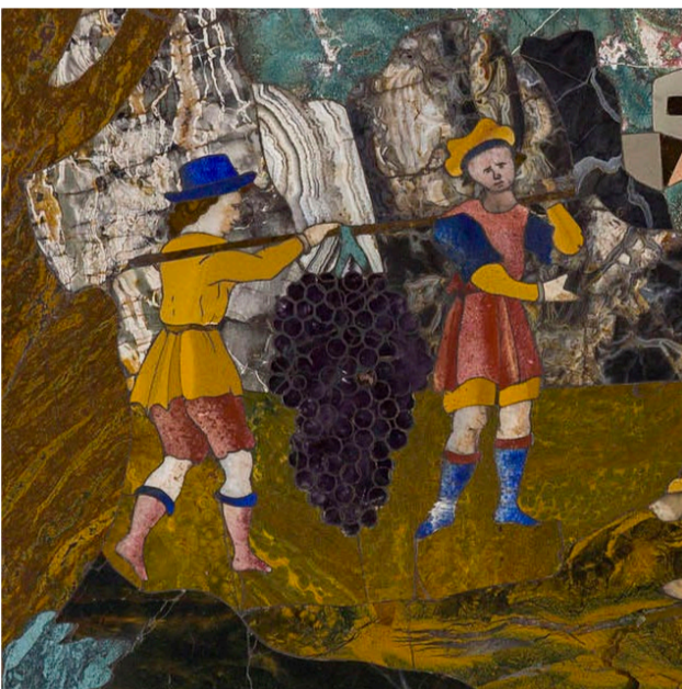
11. Florentine Grand Ducal Workshops (?), The Promised Land , detail, 1610–20. Rome, Galleria Borghese.