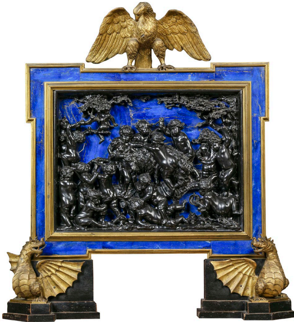
14. Giovanni Campi (after a model by François Duquesnoy), Bacchanal of Putti , 1649–50. Rome, Galleria Borghese.

Florentine branch of the family, although the precise nature of the relationship remains unclear. 21